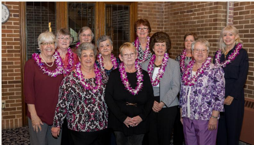
Class of 1967 Celebrates 50 th Reunion